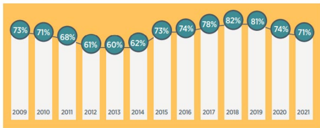
Percent of Organizations That Are Victims of Payments Fraud Attacks/Attempts

reported that their organizations were targeted by fraudsters.